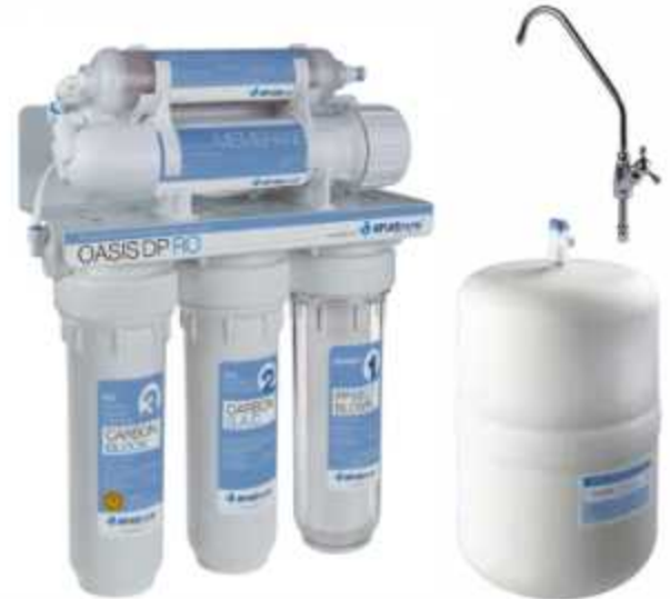
Part Number: RE6075310

Atlas Filtri® is driven to providing our customer with the best available products to meet specific filtration requirements. This is done by using the most advanced manufacturing and design methods. The international patents received come from a constant commitment to research and develop that result in new and innovative products.